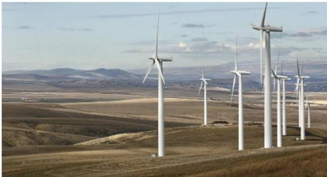
Scout Clean Energy plans a wind farm on Benton County farm land south of the Tri-Cities along the Horse Heaven Hills ridgeline south of Badger Road.

House Bill 1173 as signed will require turbines at wind power farms in Washington to be equipped with aircraft detection lighting systems that meet Federal Aviation Administration standards.