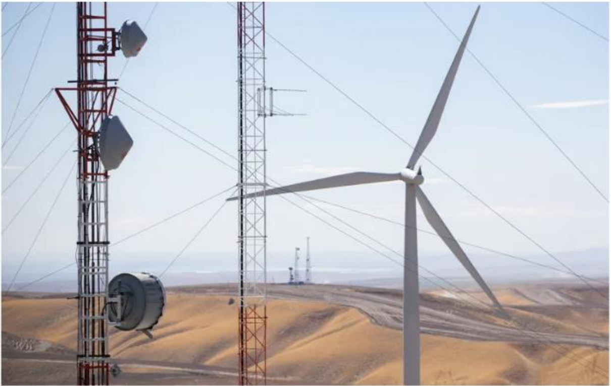
A wind turbine stands next to a cell tower overlooking Kennewick.