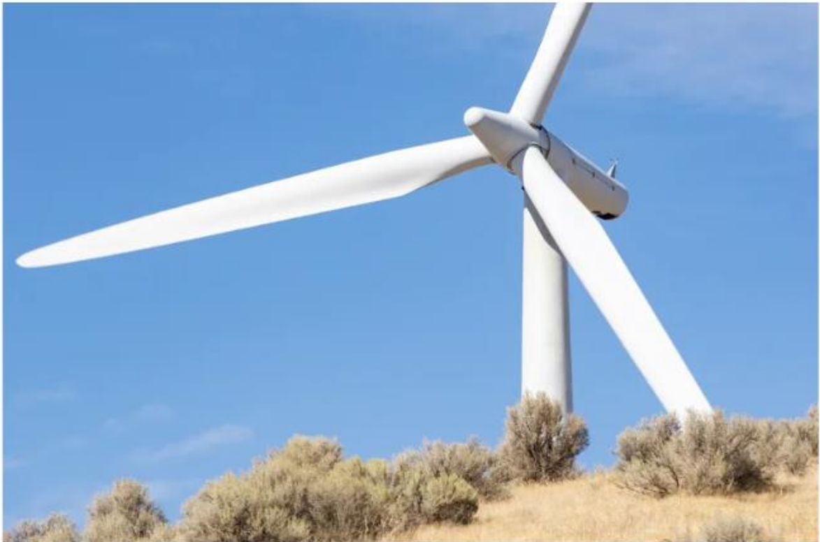
Wind turbines dot the hills overlooking Kennewick.