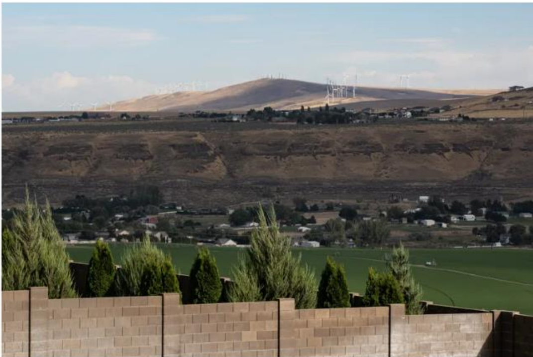
Wind turbines dot the hills overlooking Richland in September in Benton County.

A Colorado-based developer hopes to get the green light to start work in the coming months, but first it must overcome the local opposition that has slowed the project since it was proposed nearly three years ago.