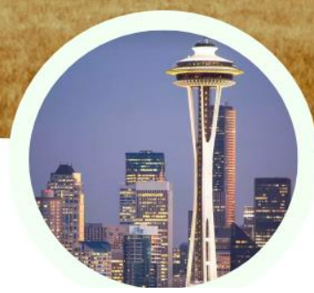
SPACE NEEDLE SIZED TURBINES

WE ARE IN A LEGAL BATTLE TO SAVE THE HORSE HEAVEN HILLS FROM A HUGE WIND TURBINE PROJECT.